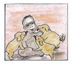
Don't let pups and dogs lick children's faces.