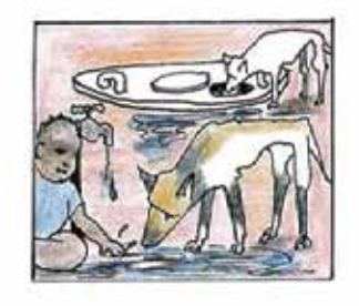
Fix broken plumbing. Give dogs their own clean water.