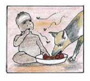
Stop dogs eating food from people's bowls.