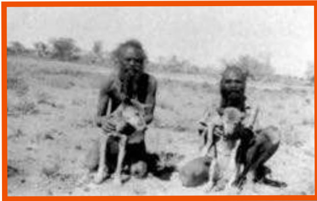
Two Aboriginal men with dingoes, Northern Territory Administration Report Lake Mackay Expedition, June/July 1957. ("Two", 1957). www.trove.nla.gov.au