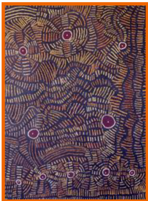
Artwork: 'Papa Tjulurrpa' (Dog Dreaming), Doris Bush Nungarrayi

Dogs are also incorporated into creation and Dreaming knowledge for some Indigenous clans.