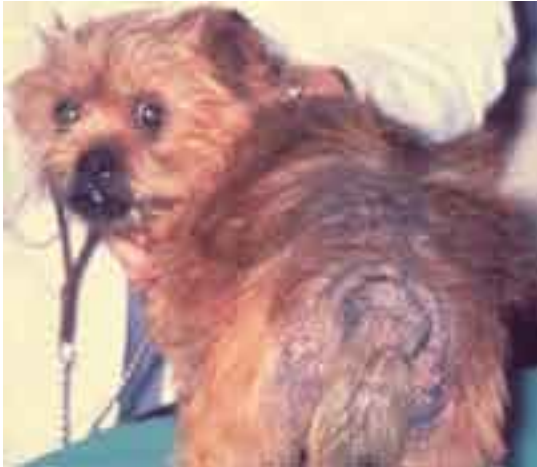
Figure 11. Flea allergy dermatitis.

immune suppression of dogs already facing immune compromise. Severe pyoderma can be rapidly induced with prednisolone therapy. Of course there are always exceptions to these generalisations and responsible owners can be given the choice of prednisolone to control symptoms.