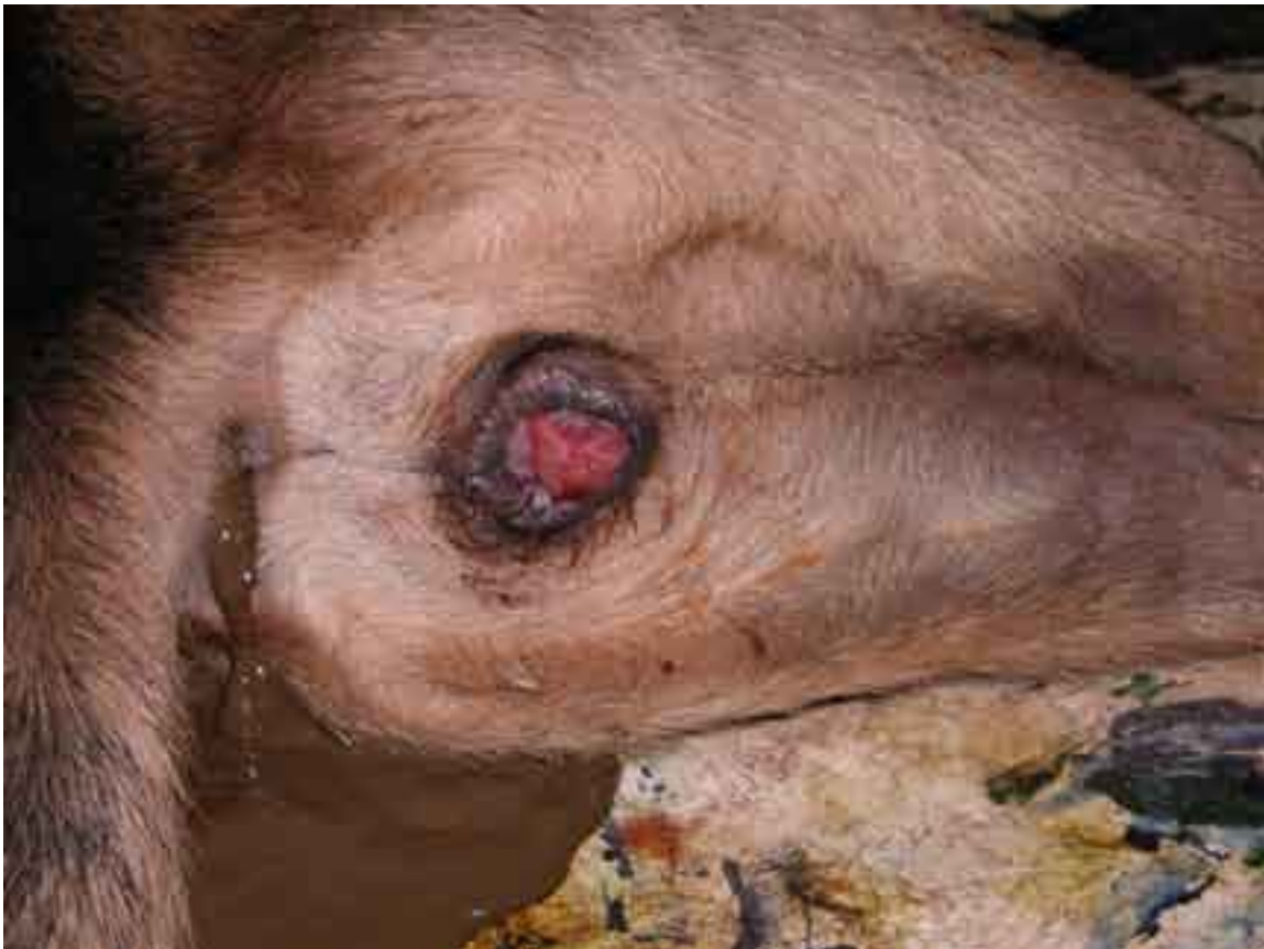
Figure 13. TVG in an undesexed female. Additional diarrhea became obvious on induction.

Indigenous people have observed the phenomenon of spontaneous regression repeatedly and are sometimes happy to wait for self-resolution. In other cases owners are concerned about the dog continually dripping blood around the house. In houses with small children, parents may be anxious about the potential spread of the infection to their children. TVG is not a zoonotic disease.