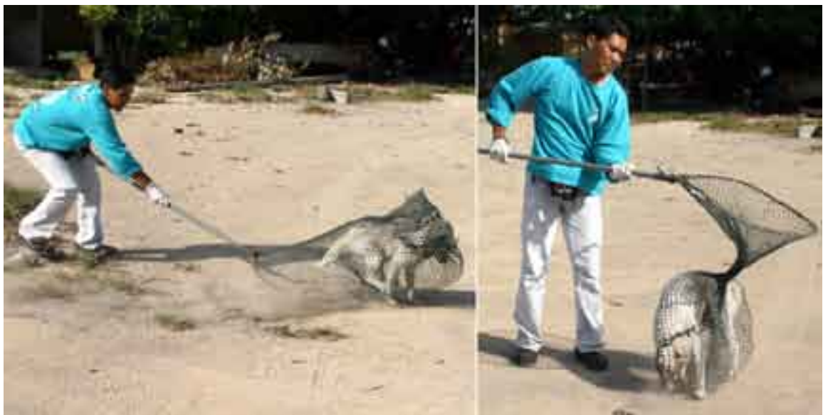
Figure 1. Catching dogs with large nets in Bali.

This method involves sedation using acepromazine tablets. A dose of 6 mg/kg is hidden in sausage and thrown to the dog. Throwing food from a vehicle sometimes works better than people approaching on foot. You should return in around three hours to catch and euthanase the dog using a catching pole and pentothal administered intravenously.