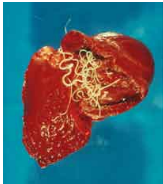
Figure 8. Adult Heartworm in situ.

Adult worms range from 12-30 cm in length. They are found in the pulmonary arteries and right ventricle of the heart. Immature forms of heartworm, microfilariae, are found in the circulation and measure about 300 µm in length. Additional larval forms in the third to fifth stages (L3-L5) may be found in the connective tissues of the dog and range from 900 µm to 5 cm in length respectively.