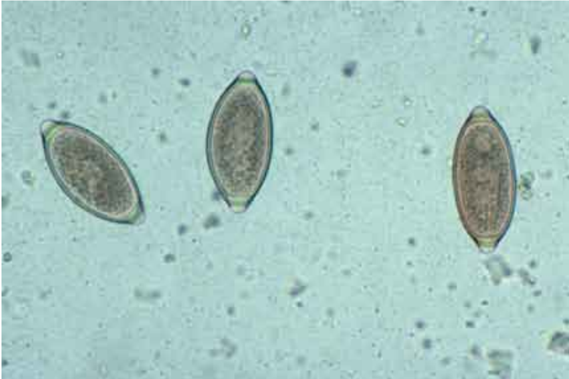
Figure 6. Trichuris egg.

The host ingests infective eggs in the environment. Worms hatch in the small intestine and then migrate to the caecum and occasionally the colon where they