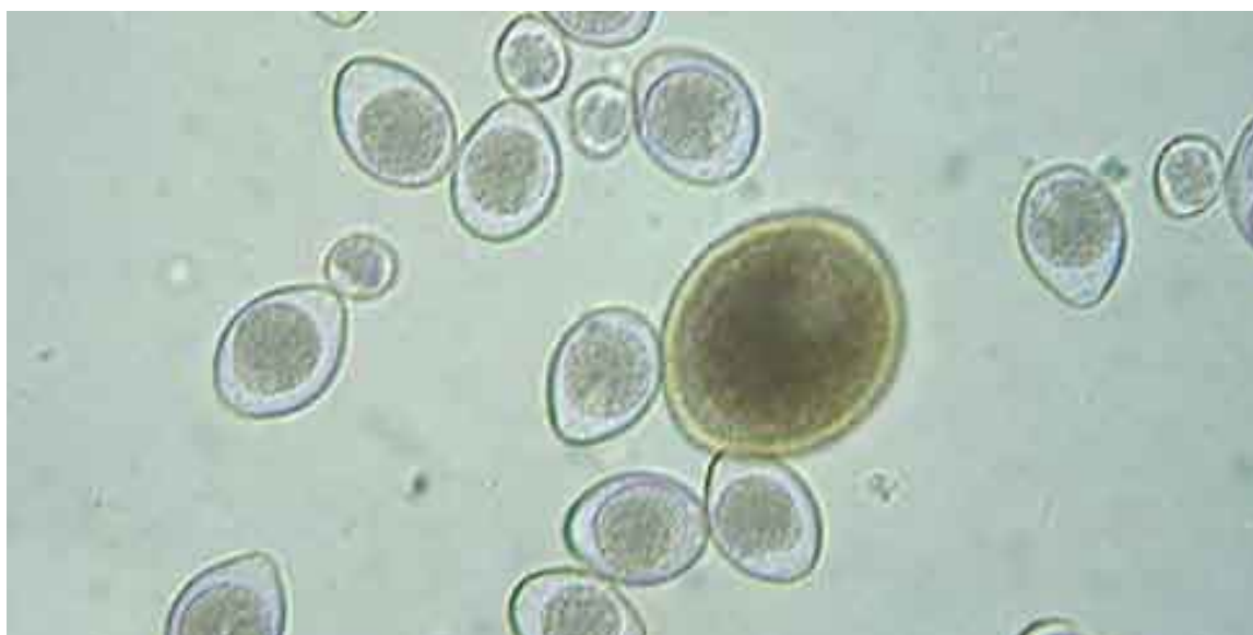
Figure 5. T. canis egg.

degree via the maternal milk supply. Pups infected in this way can develop a patent infection by three weeks of age.