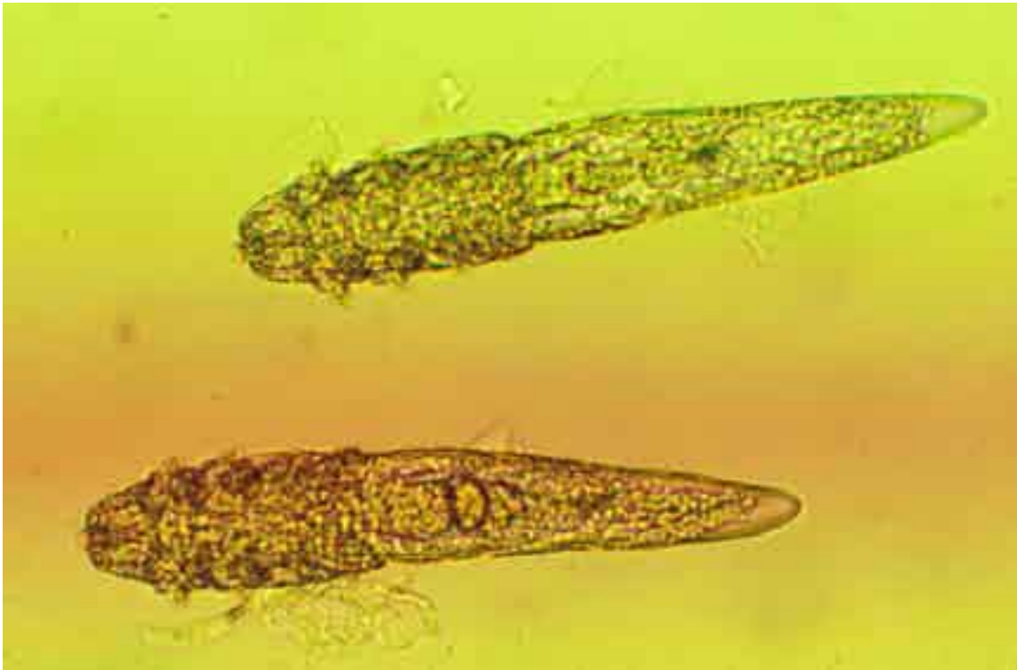
Figure 5. Adult Demodex mites.