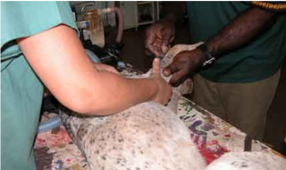
Figure 4. Administering IV anaesthetic agent. For those wanting registration for the use of injectable euthanasia solutions, a week anaesthetising animals is invaluable venipuncture training.

The basic anaesthetic protocol used by many practitioners is given as an example below. In all cases dose rates must be adjusted according to the health and age of the animal. It is wise to be cautious when estimating an animal’s age prior to anaesthesia. Due to chronic skin conditions animals can appear