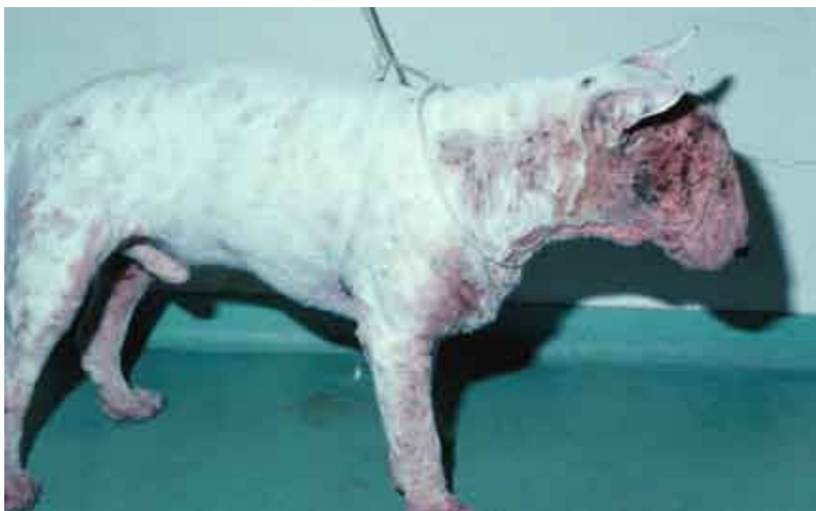
Figures 2 & 3. Scabies infected dogs.

Adult female scabies mites measure 0.4 mm in length, males are 0.2 mm in length. The mites are round bodied.