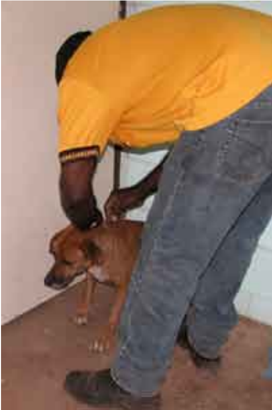
Figure 3. An assistant premedicating a dog for surgery.

It goes without saying that it is essential to establish informed consent prior to performing any surgery. Explain thoroughly to people what will be occurring. People tend to talk of desexing in terms of an operation to “stop him or her breeding up” or in females to “take out the baby bag” or in males to “make him bullocky” or “cut his dilly bag”. This is by no means universal and your guide and interpreter is invaluable in these situations. Answer any questions in a detailed way. Do not promise what you may not be able to deliver. All owners know there is a risk involved in operations so do not deny this truth. However, when asked offer people your success rates so they can make informed judgements about your skill as a surgeon.