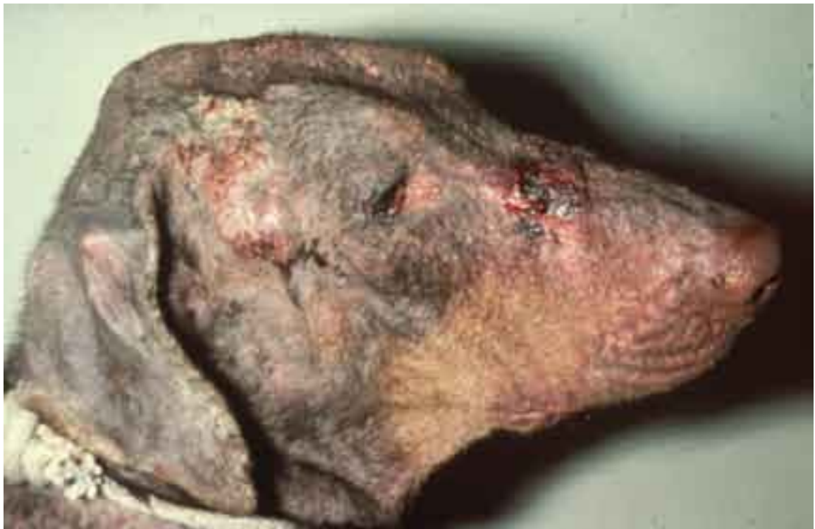
Figure 6. Adult dog with Demodex, clinically indistinguishable from scabies.

If owners are compliant and have a safe storage facility in their homes it is worthwhile conducting a scabies treatment trial using ivermectin, three doses at 300 ugm/kg given at fortnightly intervals. On the next visit discuss the effects of the treatment trial. If the owner reports that the dog's condition improved minimally and the dog is not extremely pruritic suspicions of D. canis alopecia ought to be strengthened.