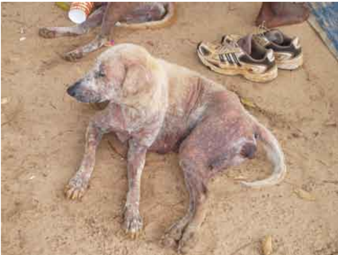
Figure 1. Scabies or not?

Whilst scabies does predominate in many communities, the immune suppression of many dogs results in the prevalence of other skin conditions such as ringworm and demodex. Flea allergy dermatitis also occurs with variable frequency. It is not uncommon for people to see these skin conditions as a failure of the scabies control program.