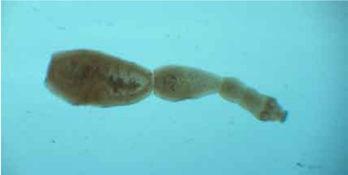
Figure 7. Adult E. granulosus .

penetrates the intestinal wall entering the portal circulation or mesenteric lymph vessels. The larva then lodges in an organ, frequently the liver, and encysts, beginning a cycle of asexual reproduction.