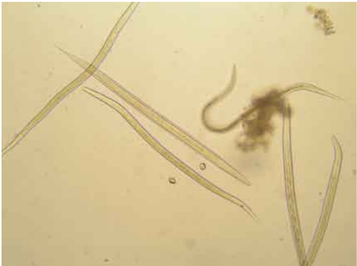
Figure 2. Hookworm infective larvae. The infective larvae are about 0.5 mm in length, attracted to heat, and can actively swim in a water film towards a host.

Infective larvae enter the dog by 1) penetrating intact skin or 2) ingestion. Penetration of infective larvae through the foot pads is the optimal route. Infective larvae enter the capillaries, flow through the right side of the heart and into the pulmonary capillaries. They mechanically burst across into the alveolae, causing surprisingly little damage apart from microscopic haemorrhage. Larvae migrate up the trachea and return to become adults in the small intestine. Some infective larvae do not undergo