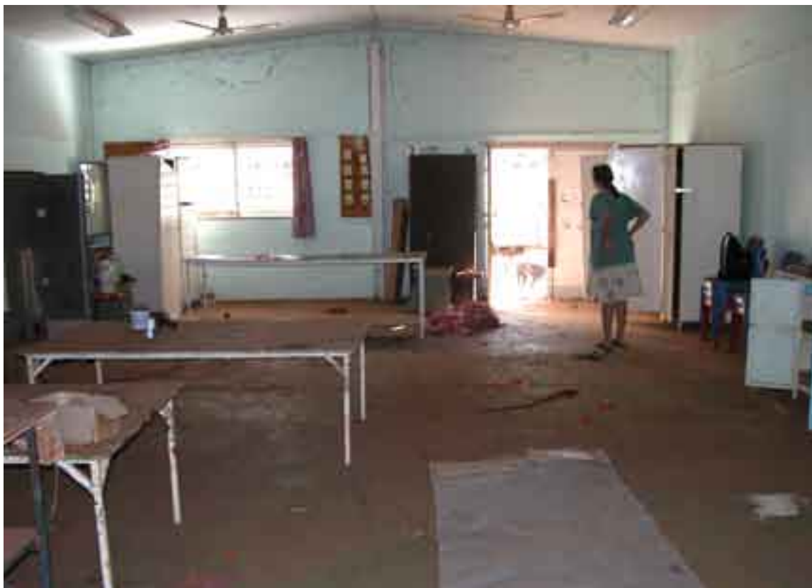
Figure 2. A seldom used art centre, an excellent site to conduct surgery: it’s shady, ventilated, light, lockable and has running water.