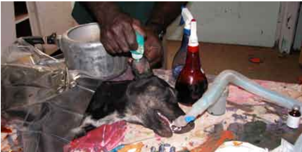
Figure 7. Don't forget the tattoo!!!

A minimum of two full spey kits is recommended. The more kits you have the easier your day will be. For working outdoors additional towel clamps need to be added to your usual spey kit to overcome the problem of wind gusts. Additional large spey clamps or haemostats are also recommended.