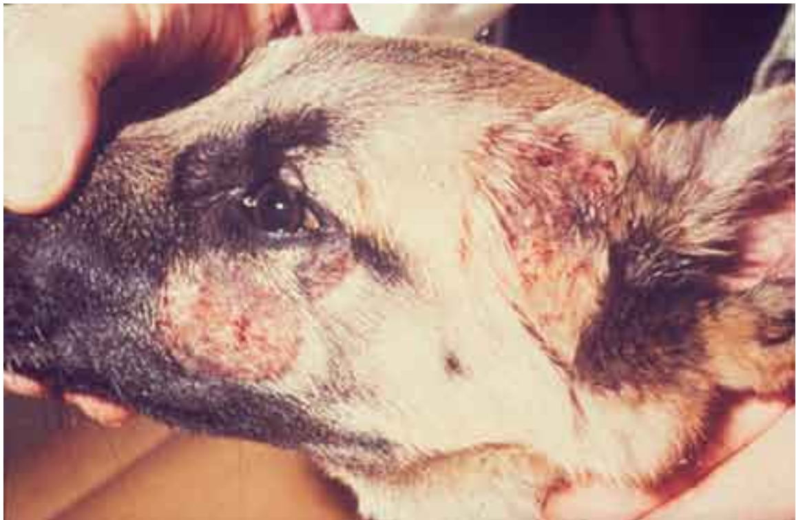
Figure 8. Early single ringworm lesions.

Clinical signs vary from asymptomatic carriage to a near complete alopecia in sick puppies. The classical sign of circular alopecia is not always evident and is more common in cats than dogs. In most dogs however close examination will reveal circular areas of hyperpigmentation. Whilst not diagnostic this is suggestive of ringworm. Discussions with owners may also reveal that the disease began with circular alopecia but then rapidly spread to generalised alopecia lesions.