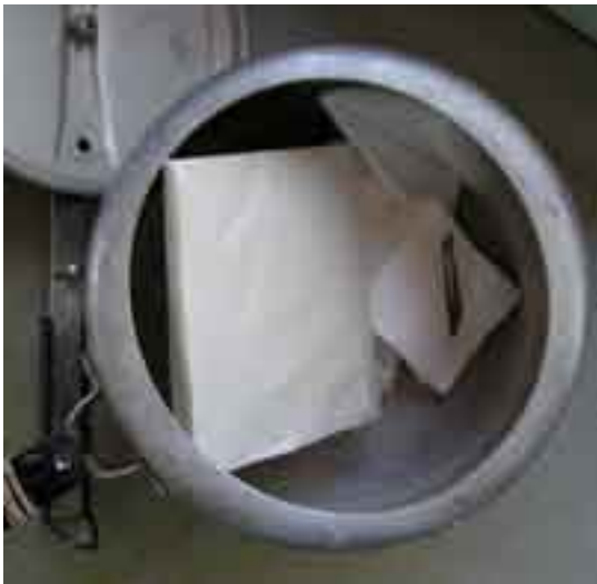
Figure 9. Contents of the pressure cooker used throughout the day: gloves, drape, scalpel, swabs and needles.

Usually running water is available, however some outstations have periodic difficulty with clean running water supplies for various