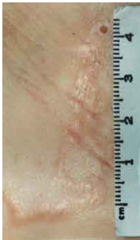
Figure 3. Cutaneous larval migrans (CLM) on the ankle of a white resident of Townsville. The lesion starts as an itchy erythematous papule that moves, leaving a red line. This lesion had been present for six weeks. The initial lesion is just above the 4 cm mark on the ruler, and the migratory path wanders down parallel to the ruler and then turns at 90° to move towards the left of the picture. CLM is usually self-limiting and rarely lasts longer than two months. Which hookworm species is the cause of any individual case of CLM is almost impossible to determine.

presence of an adult worm in the intestine. The factors that trigger attacks of eosinophilic enteritis are unknown. With the present state of knowledge about eosinophilic enteritis, it is impossible to speculate how significant it may be in Aboriginal and Torres Strait Islander communities. It appears in fact to be restricted to white urban communities.