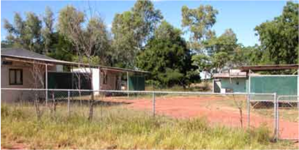
Figure 1. Standard good quality accommodation: single roomed demountables or 'dongas' with outside ablutions.