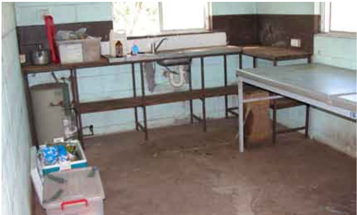
Figure 3. A disused house as a temporary surgery. The table was borrowed from the health clinic.