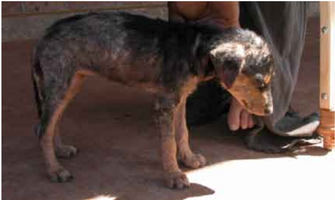
Figure 1. A fairly common sight. What disease haven't I got?

from their dogs. Recent studies have shown canine and human varieties to be genetically distinct (Currie 1998).