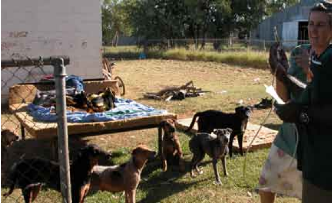
Figure 2. Delivering ivermectin to an eager audience. Encouraging dogs to catch doses on the full is the best way to deliver blanket treatment.