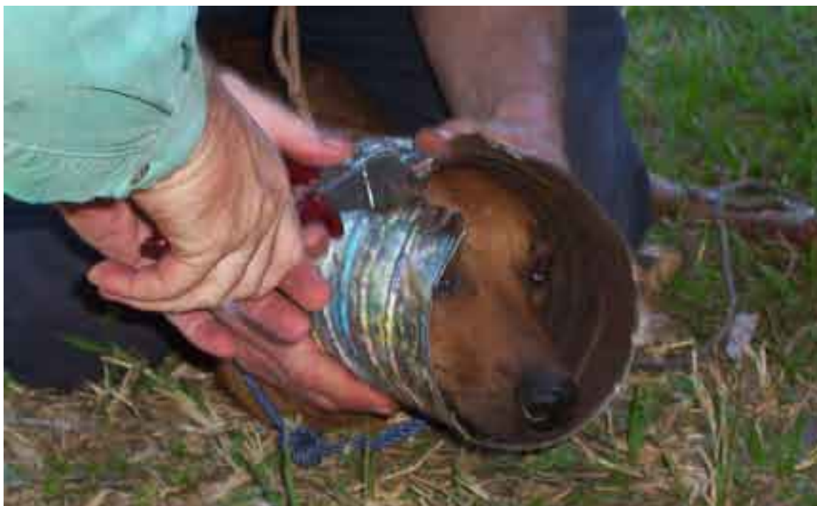
Figure 14. Removal of a milk can from a dog's head.