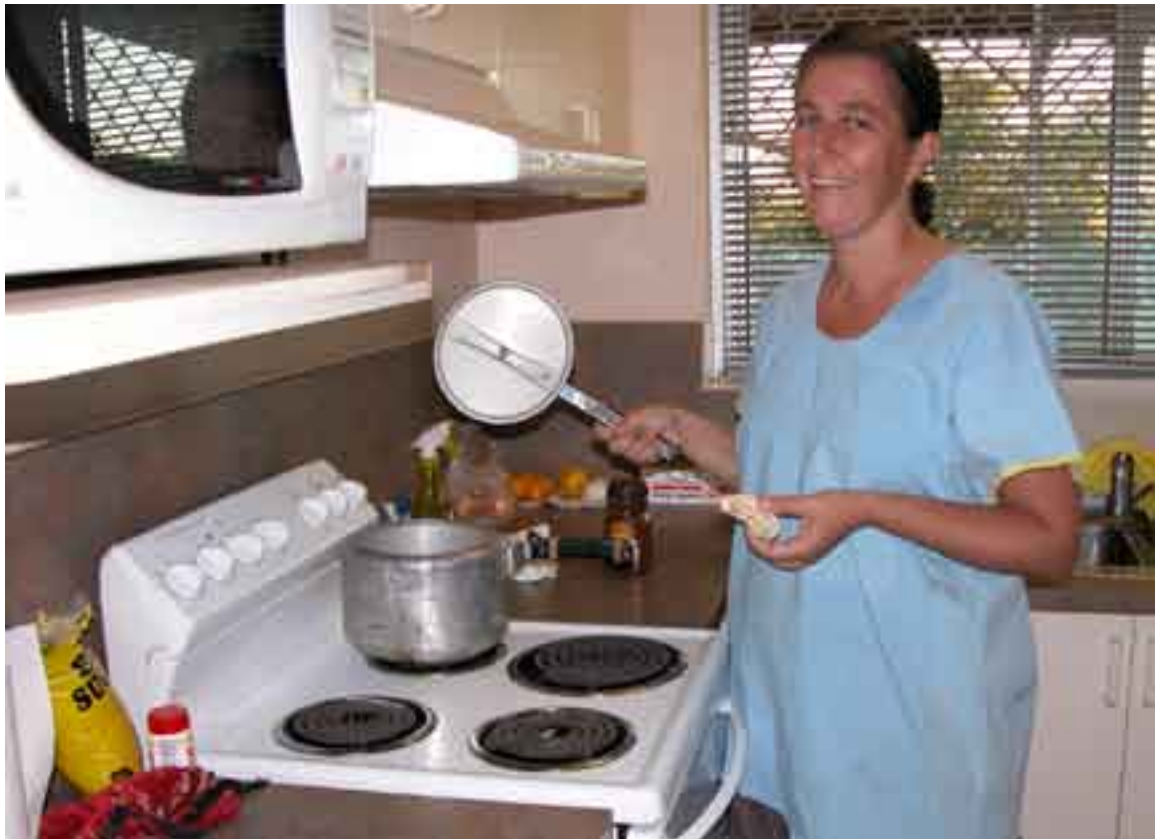
Figure 8. Cooking the empty pressure cooker over breakfast. Boil until it is dry then open the lid over heat, allow the remaining water to evaporate and reseal. You now have a sterile container for the day.

Females have often had multiple litters prior to being speyed and the cervix and ovarian pedicles can be quite large and tough.