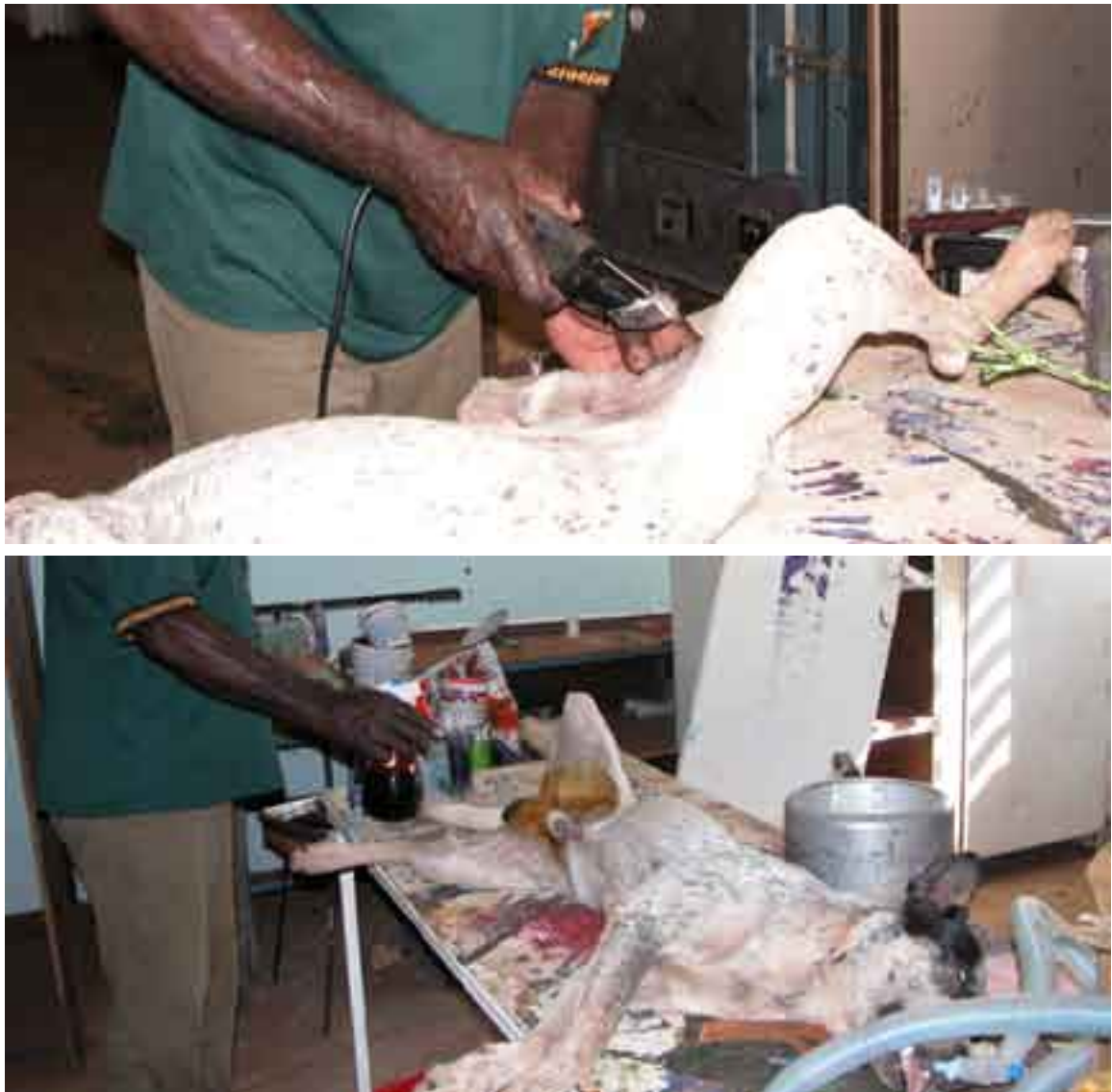
Figures 5 & 6. Preparing an animal for surgery.

far older than they really are, teeth will be worn down, as will their general demeanour by chronic itching. Giving all intravenous anaesthetics 'slowly to effect' is the best way of overcoming potential dose related problems.