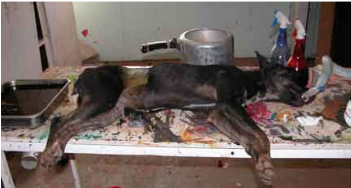
Figure 10. Looks rough, but she's ready to drape for a relatively sterile field.

The cost of suture materials can impact on the profitability of a spey significantly. Many practitioners continue to use cat gut on cassette in the field, particularly if performing flank speys. They report few, if any, problems, although greater care needs to be given to asepsis if gut is being used. If you are using gut it is advisable to carry