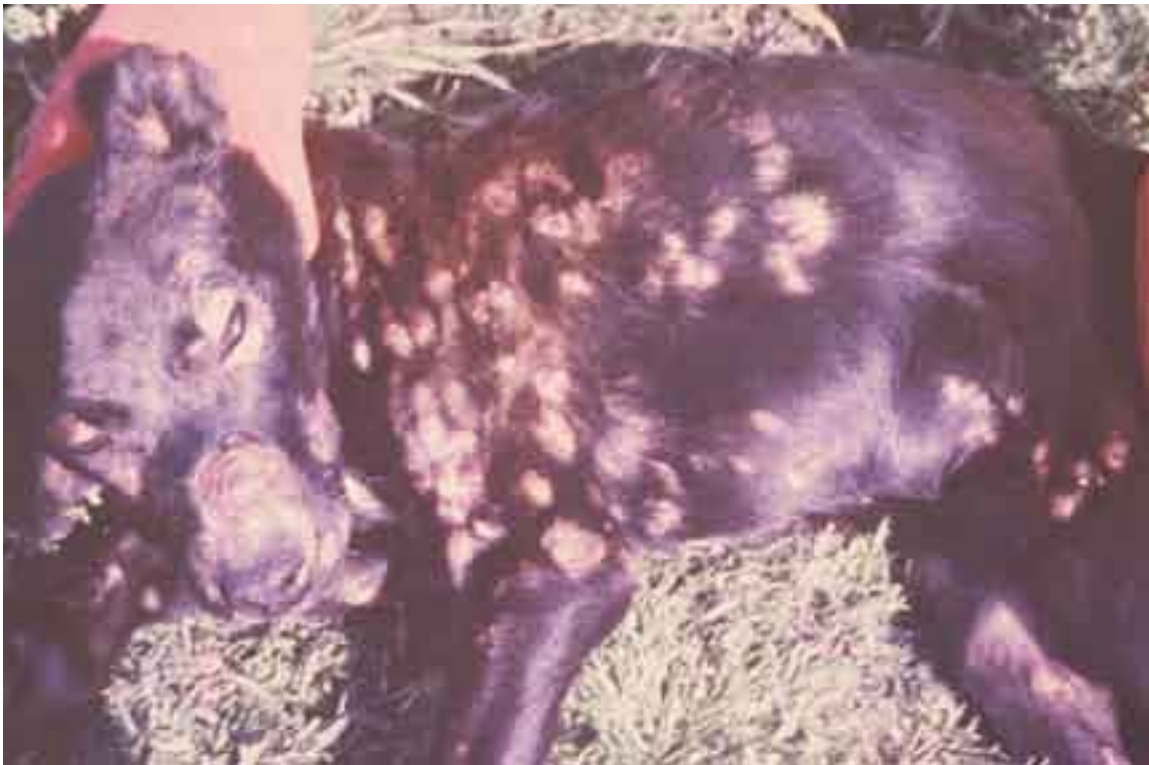
Figure 9. Multiple but still distinct lesions on a puppy.

Given the large numbers of free roaming dogs, fleas are particularly difficult to control on a household or individual dog basis. The majority of dog programs to date have