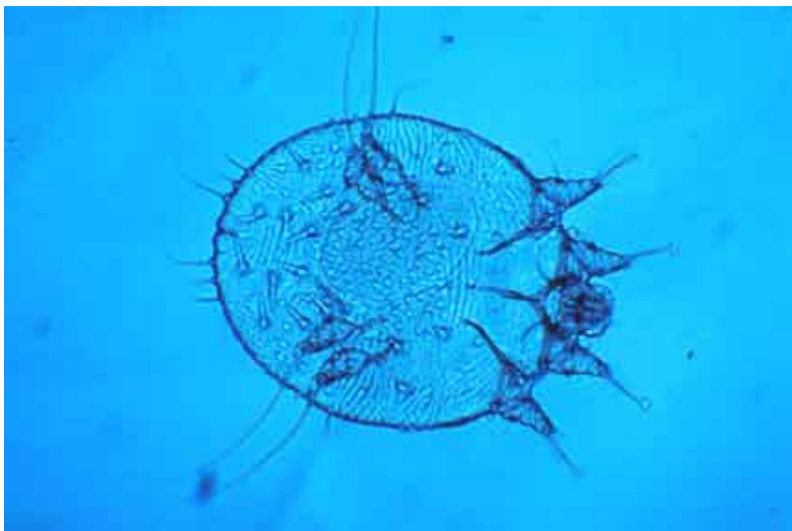
Figure 4. Adult female scabies mite.