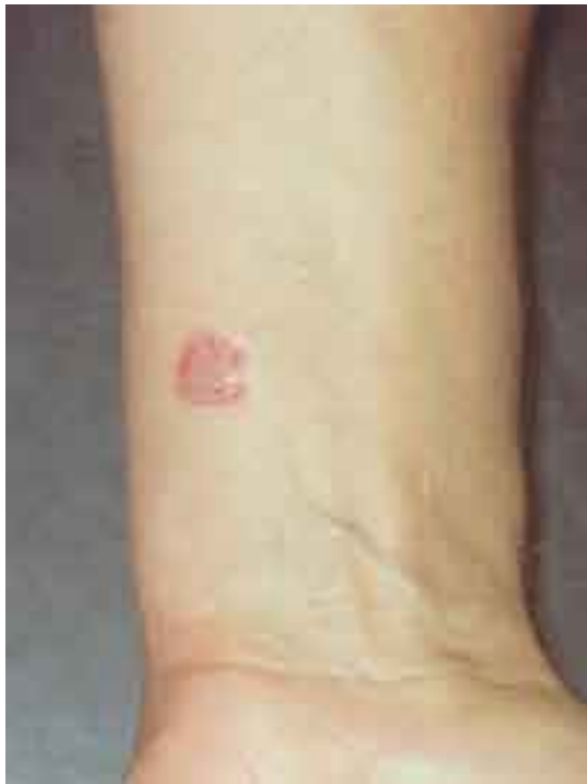
Figure 7. Human skin lesion.

These organisms are ubiquitous in the environment and often survive on asymptomatic dogs and cats for long periods of time. The hot and humid conditions of the tropics, particularly during the wet season, enhance fungal growth considerably. Most dogs living in community settings are also predisposed to fungal colonisation due to large free roaming dog populations, multiple dog households, malnutrition and immune compromise due to internal parasite burdens.