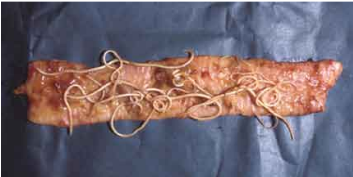
Figure 4. T. canis adult worms in situ.

» Adult female dogs have acquired age related immunity and rarely develop a patent infection. Larvae are instead disseminated via the circulation. These larvae become encapsulated in various tissues around the body. In some cases a periparturient relaxation in resistance may result in a small window where a patent infection emerges from an adult female. In the last trimester of pregnancy encapsulated forms reactivate, infecting puppies transplacentally and to a lesser