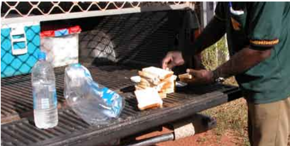
Figure 1. Making ivermectin sandwiches.

If conducting blanket ivermectin dosing it is worthwhile painting the dogs that have received treatment. A bright pink or green acrylic paint swipec along the dog's head or back prevents the same dogs being dosed at home, at the shop and again at the health clinic as they move about town with various family members. It will also allow owners to notify you if they find a dog that has missed treatment.