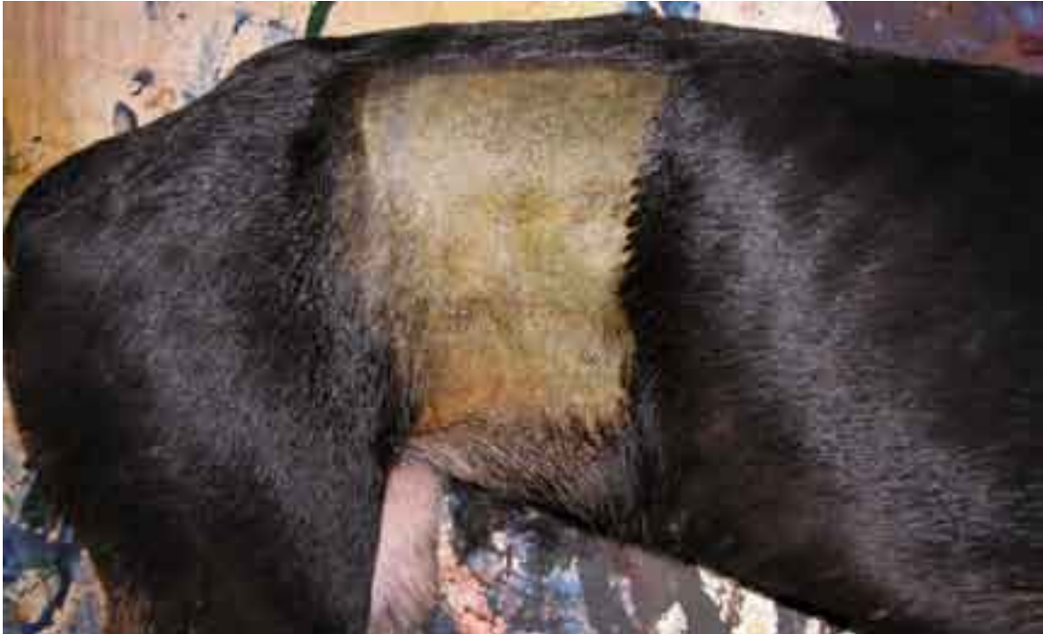
Figure 11. Area clipped and prepped for flank approach.

individual packets of synthetic monofilament material such as PDS for use in cases where a lot of suture material will be required, e.g. limb amputation and tumour removals. Alternatives to gut for routine speys are the cassette monofilament absorbable such as Monodox. These are more costly but are a superior suture material.