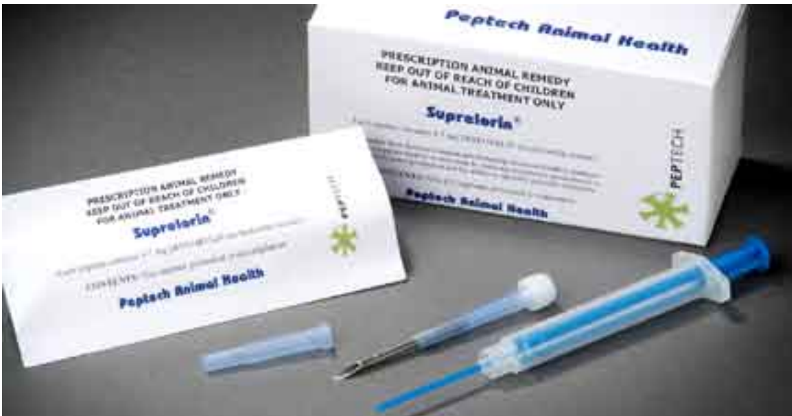
Figure 2. Implant and applicator.

as a female contraceptive in both scientific trials by Peptech themselves and also by AMRRIC veterinarians working in the field.