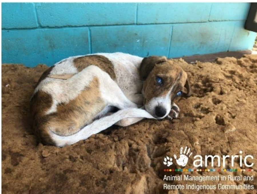
Photo 2 – A dog sick with ehrlichiosis. Notice the blue eyes, looking tired, and very skinny