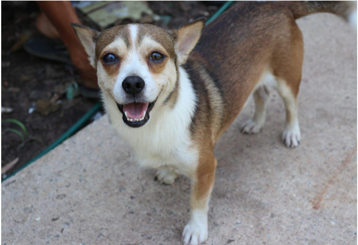
Happy, Lots of Energy