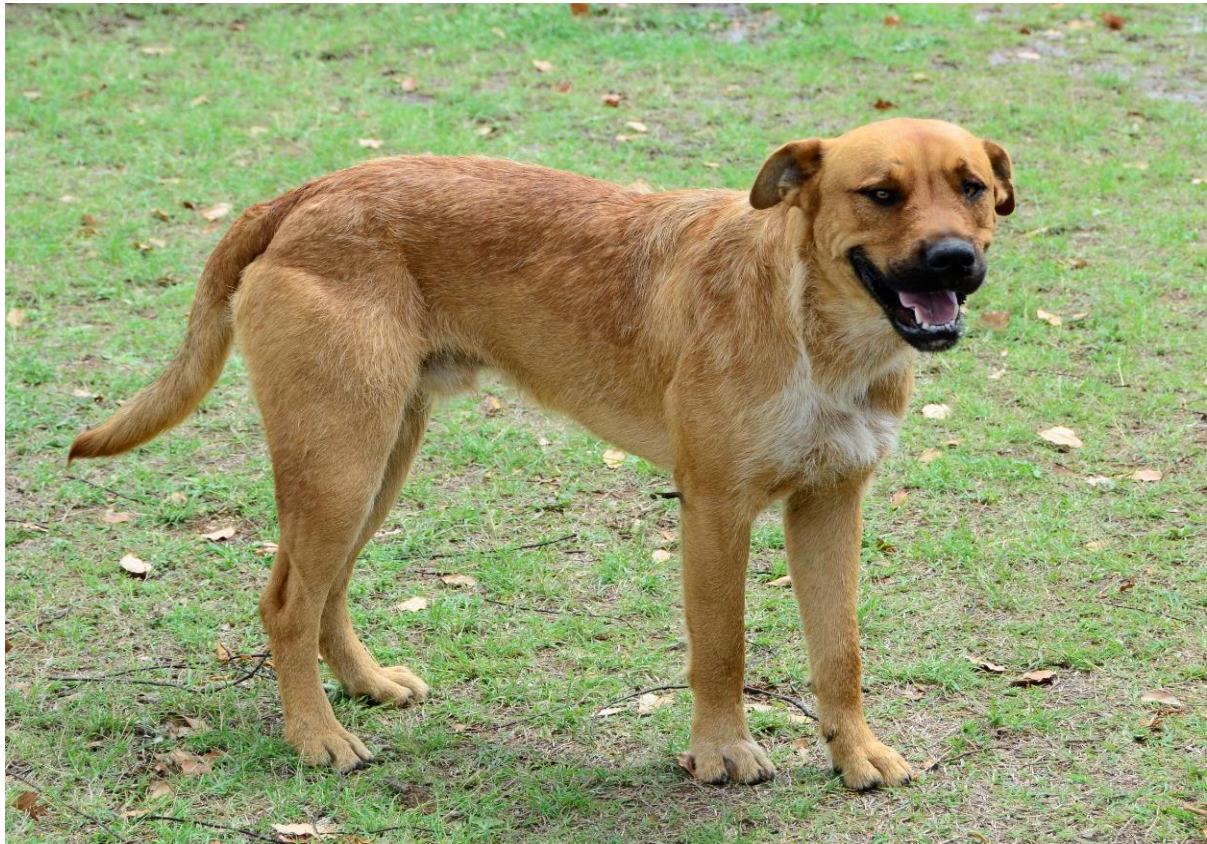
Good Body Weight and Dogs Eating/interested in food