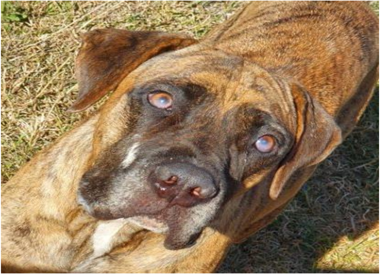
Cloudy Blue Eyes and Skinny Body