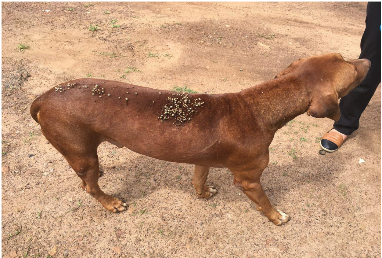
Brown Dog Ticks