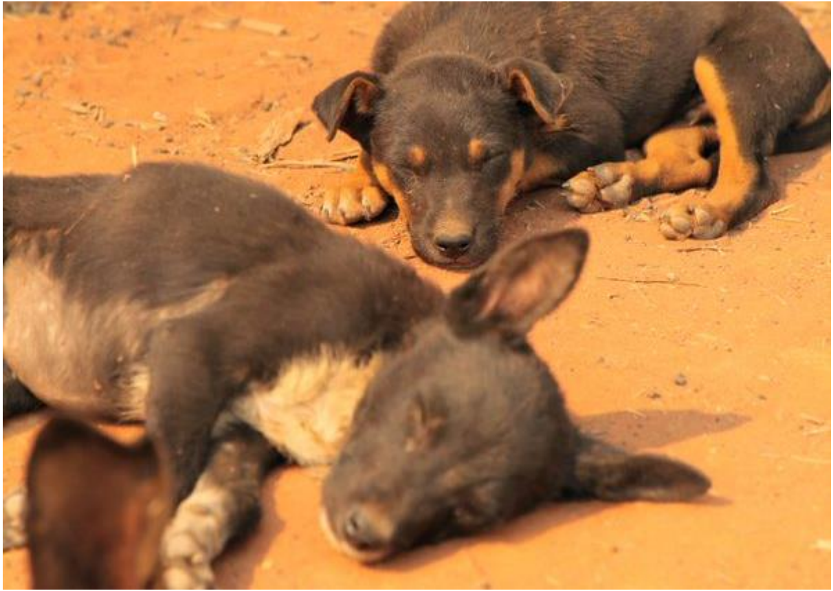
Tired/Sleepy and Dog Not Eating