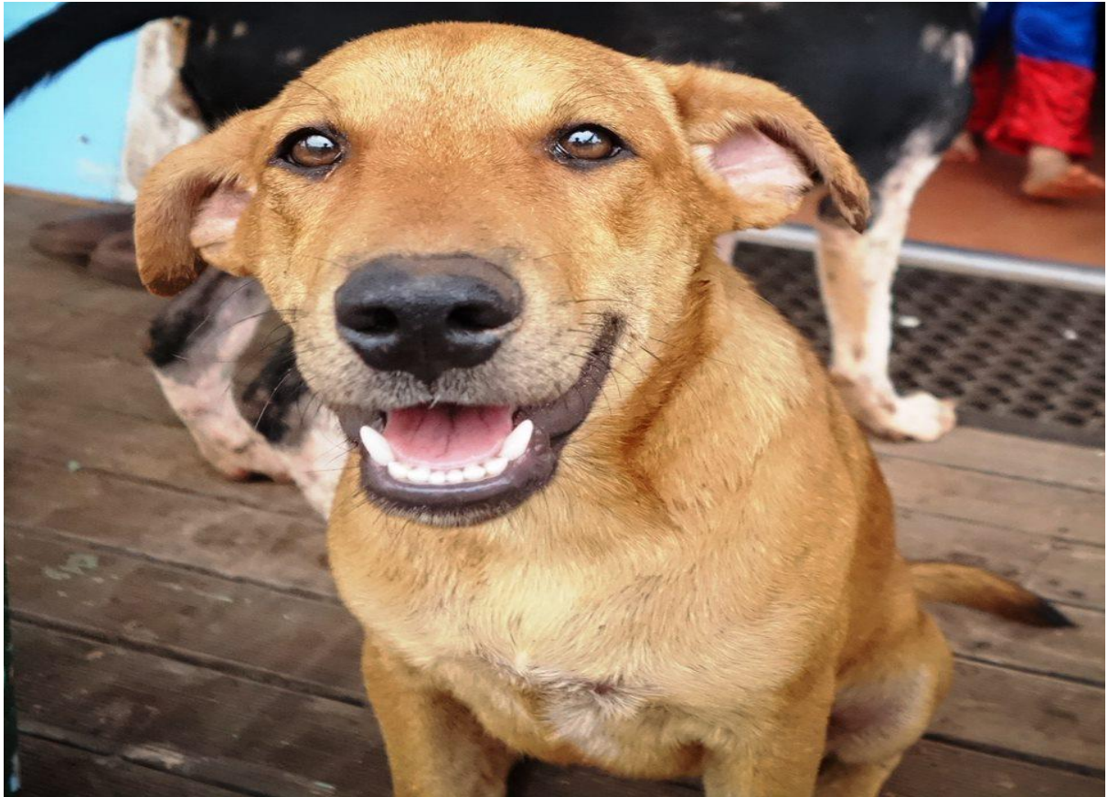
Good Skin and Good Eyes (No blue cloudiness)