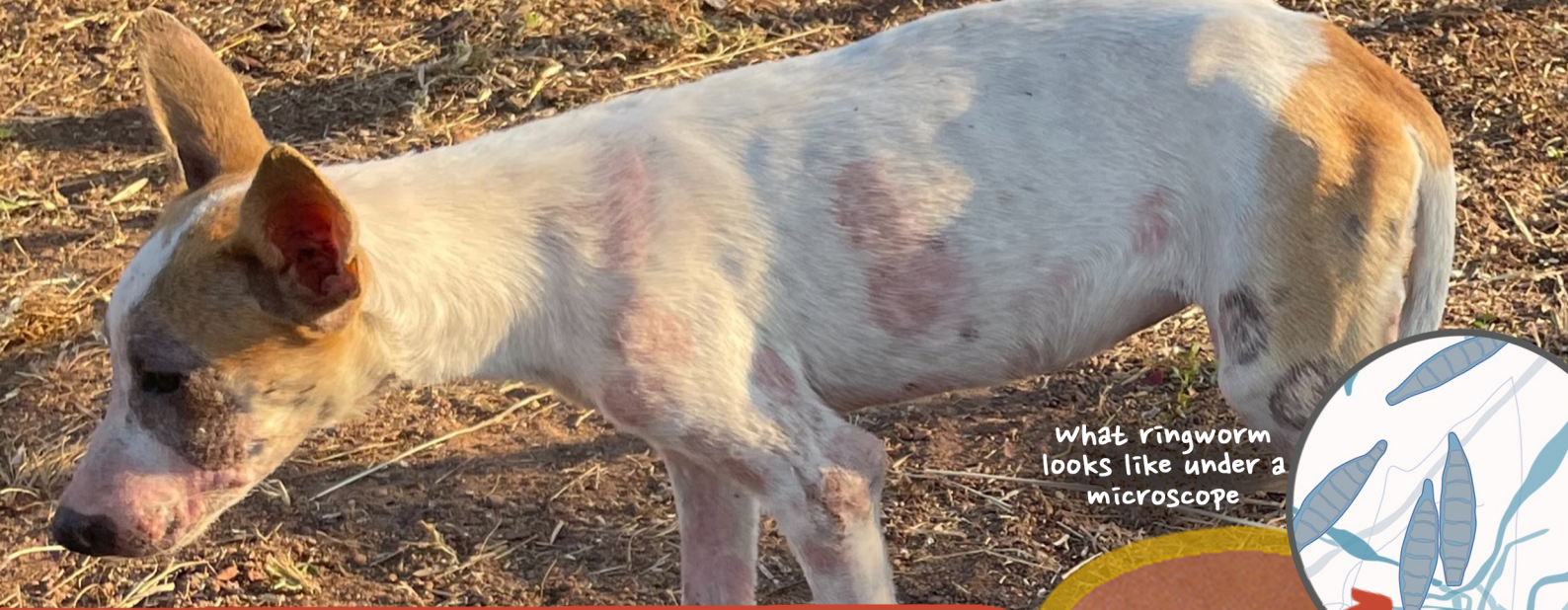
What ringworm looks like under a microscope