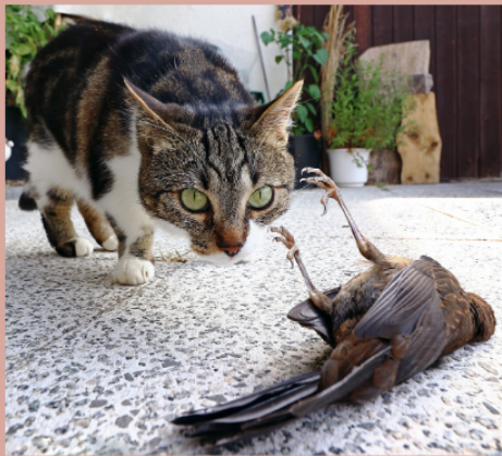
Killing our native animals